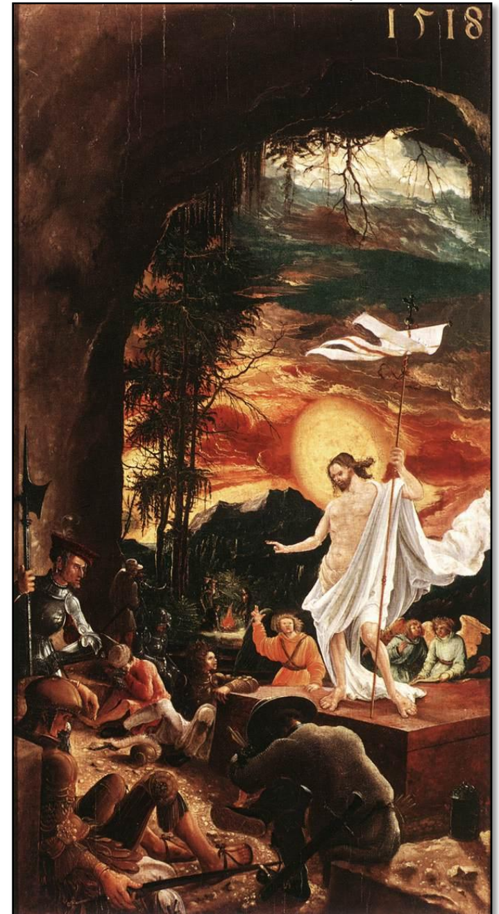
Albrecht Altdorfer, The Resurrection of Christ , 1516-18

The Sunday prayers are used for the whole week. Prayers can be used as mealtime prayers or family prayers throughout the day. Omit sections in parentheses if not using for mealtimes.