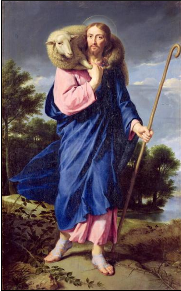
Philippe de Champaigne, Good Shepherd , 17 th century

“Truly, truly, I say to you, he who does not enter the sheepfold by the door but climbs in by another way, that man is a thief and a robber; but he who enters by the door is the shepherd of the sheep. To him the gatekeeper opens; the sheep hear his voice, and he calls his own sheep by name and leads them out. When he has brought out all his own, he goes before them, and the sheep follow him, for they know his voice. A stranger they will not follow, but they will flee from him, for they do not know the voice of strangers.” This figure Jesus used with them, but they did not understand what he was saying to them.