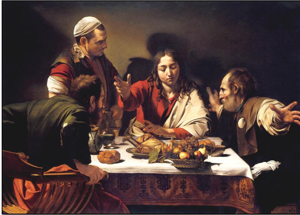
Supper at Emmaus, Caravaggio, 1601

That very day two of them were going to a village named Emmaus, and talking with each other about all these things that had happened. Jesus himself drew near and went with them. But their eyes were kept from recognizing him. And he said to them, “What is this conversation which you are holding with each other as you walk?” And they stood still, looking sad. Then one of them answered him, “Are you the only visitor to Jerusalem who does not know the things that have happened there in these days?” And he said to them, “What things?” And they said to him, “Concerning Jesus of Nazareth, and how our chief priests and rulers delivered him up to be condemned to death, and crucified him. Yes, and besides all this, it is now the third day since this happened. Moreover, some women of our company amazed us. They were at the tomb early in the morning and did not find his body; and they came back saying that they had even seen a vision of angels, who said that he was alive.”