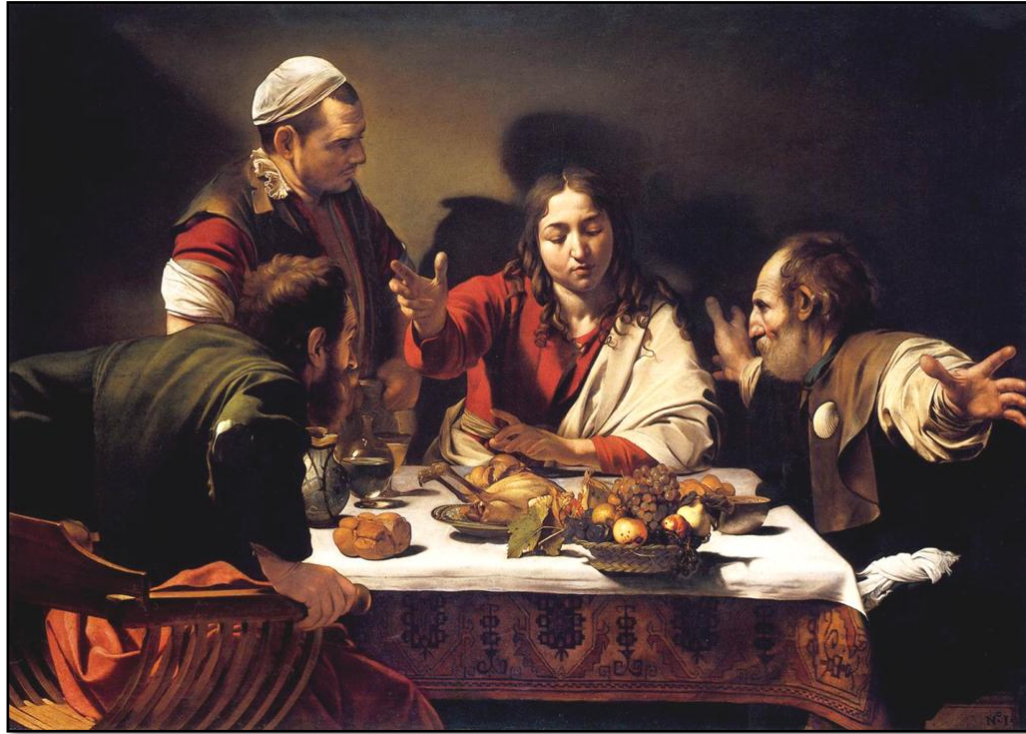
Supper at Emmaus, Caravaggio, 1601

That very day two of them were going to a village named Emmaus, and talking with each other about all these things that had happened. Jesus himself drew near and went with them. But their eyes were kept from recognizing him. And he said to them, “ What is this conversation which you are holding with each other as you walk? ” And they stood still, looking sad. Then one of them answered him, “Are you the only visitor to Jerusalem who does not know the things that have happened there in these days?” And he said to them, “ What things? ” And they said to him, “Concerning Jesus of Nazareth, and how our chief priests and rulers delivered him up to be condemned to death, and crucified him. Yes, and besides all this, it is now the third day since this happened. Moreover, some women of our company amazed us. They were at the tomb early in the morning and did not find his body; and they came back saying that they had even seen a vision of angels, who said that he was alive.”