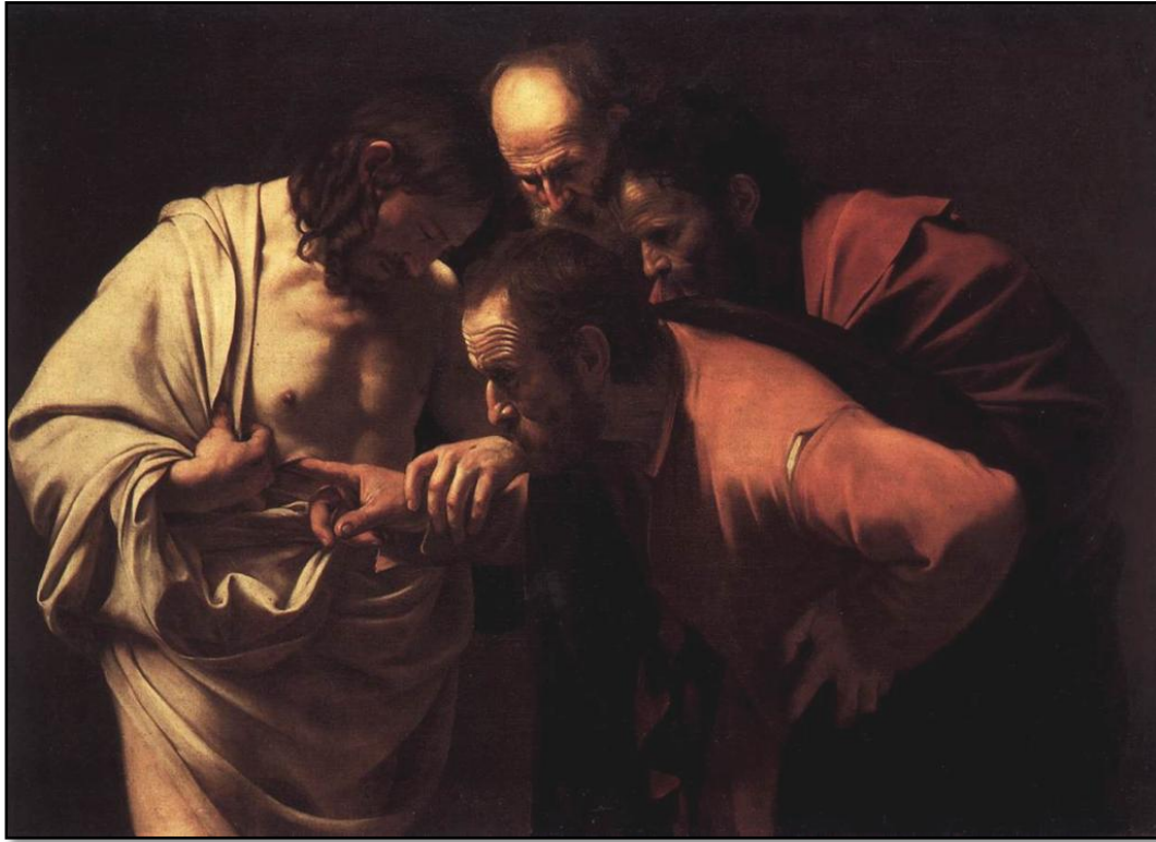
The Incredulity of Saint Thomas, 1601-02, Caravaggio

On the evening of that day, the first day of the week, the doors being shut where the disciples were, for fear of the Jews, Jesus came and stood among them and said to them, “Peace be with you.” When he had said this, he showed them his hands and his side. Then the disciples were glad when they saw the Lord. Jesus said to them again, “Peace be with you. As the Father has sent me, even so I send you.” And when he had said this, he breathed on them, and said to them, “Receive the Holy Spirit. If you forgive the sins of any, they are forgiven; if you retain the sins of any, they are retained.”