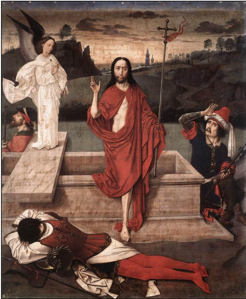
Dieric Bouts, the Elder, Resurrection , 1450-60